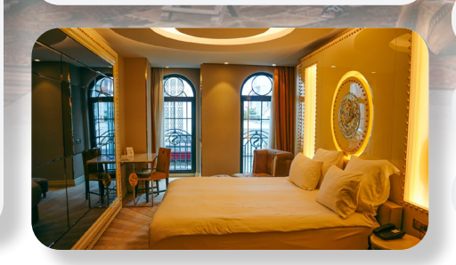
Caverna Hotel Premium Caves 3 nights • $771 per person, twin share